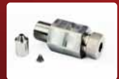
Thimble Filter 1/4" 1/4" F to 1/4" M HP Kit 14279