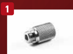
1 Inlet for 3/8" tubing

Option 1 is for a standard 3/8" abrasive feed line. Option 2 is for a smaller 3/16" abrasive feed line, which is typically used on Omax style equipment.