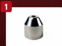
1 Standard Nut

Option 1 is a standard nozzle nut. Option 2 & 3 offer a protective nozzle nut, which feature a replaceable rubber splash guard and a carbide braised nut. Option 2 is for use with 3" long nozzles, while option 3 is for 4" long nozzles.