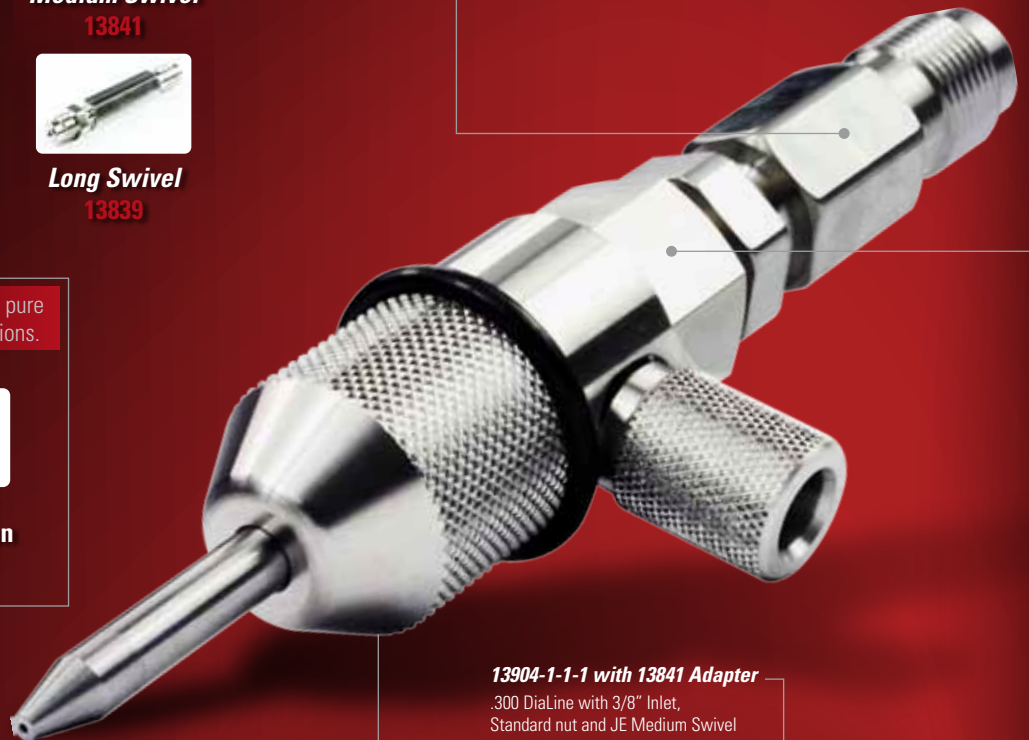
13904-1-1-1 with 13841 Adapter .300 DialLine with 3/8" Inlet, Standard nut and JE Medium Swivel