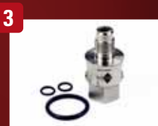
3 Dual Inlet Body for .281 nozzles