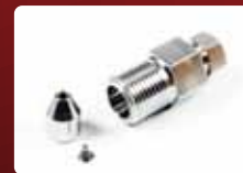
Thimble Filter 1/4" 1/4" F to 3/8" M HP Kit 13553