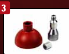
3 4" Nozzle Nut with Nozzle Guard