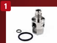
1 Abrasive Body for .300 nozzles

Option 1 is standard cutting head body for use with .300 OD nozzles. Option 2 is also a standard cutting head body and utilizes .281 OD nozzles. Option 3 features two abrasive inlets, primarily used for piercing brittle materials, it also uses .281 OD Nozzles.