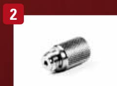
2 Inlet for 3/16" tubing