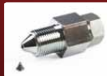
Thimble Filter 3/8" 3/8" F to 3/8" M HP Kit 13174

In order to maximize the life of your DialLine Diamond AccuStream recommends the use of our Thimble style filter. A 600 hour warranty on the Diamond orifice is offered to those customers using the thimble filter. The Thimble filter is a small stainless filter with very small holes drilled in a unique pattern to capture any foreign debris which might damage the diamond.