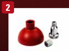
2 3" Nozzle Nut with Nozzle Guard