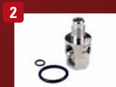
2 Abrasive Body for .281 nozzles