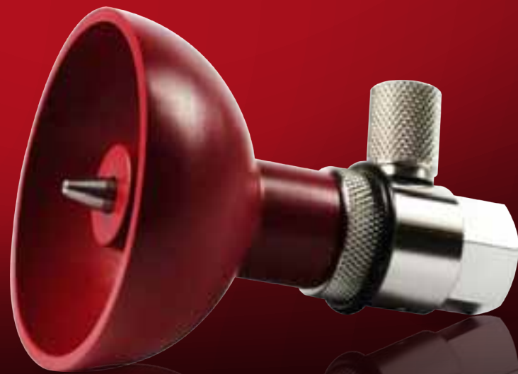
.300 DialLine shown with 3/16" Inlet, 3" nozzle and protective spray guard. 13904-1-2-2