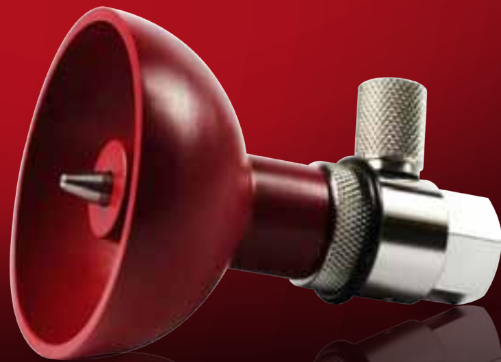
.300 DiaLine shown with 3/16" Inlet, 3" nozzle and protective spray guard. 13904-1-2-2