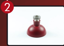
3" Nozzle with Nozzle Guard