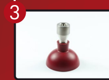
4" Nozzle with Nozzle Guard (.281 only)