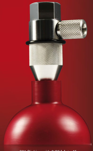
.281 DialLine with 3/8" Inlet, 4" nozzle and protective spray guard. 13904-2-1-3