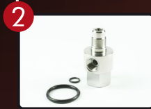
Abrasive Body for .281 nozzles