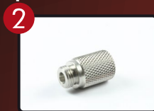
Inlet for 3/16" tubing

NOTE: Two Inlets are included if option 3 (dual inlet) is selected above.