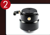
Top Inlet Actuator