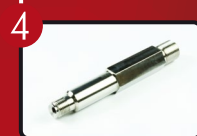
Long Swivel 13839 A-DIM * 230.5 mm 9.075 in