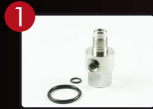
Abrasive Body for .300 nozzles