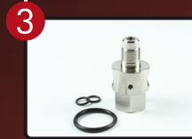
Dual Inlet Abrasive Body for .281 nozzles

NOTE: All abrasive bodies come with inlet O-rings and nozzle nut O-rings.