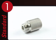
Inlet for 3/8" tubing