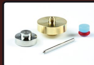
On/Off Valve Kit 11328